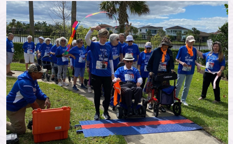
It's Wisdom Warrior Challenge Race Day!