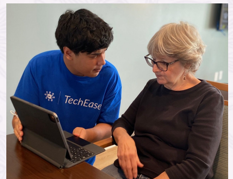
Intergenerational technical support provided to our residents by TechEase.