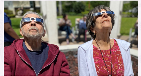
Residents enjoying the spectacular view of the recent Eclipse.