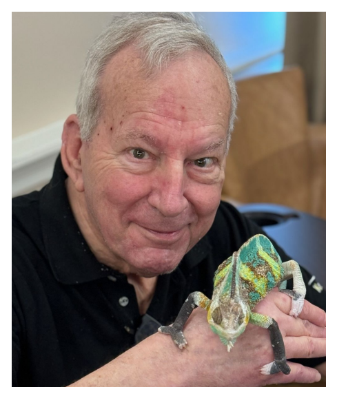
Residents had an amazing time during an RUIU class as they had the opportunity to meet and discover more about veiled chameleons, various geckos, bearded dragons, ball pythons, and tortoises!