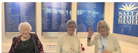
Our Maltz Season Ticket Holders out at the performance of Plaza Suite. Make sure to ask about next season tickets!