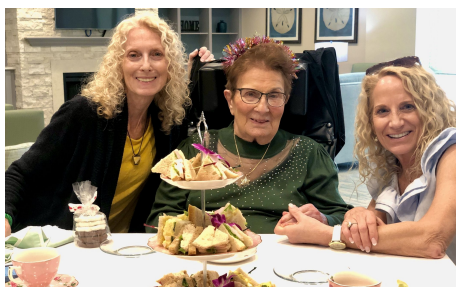
Come and join the fun and engaging social events in Inspiritas - Memory Care.