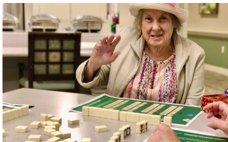
Our Inspiritas residents enjoyed learning and playing the Chinese social and traditional game of Mahjong.